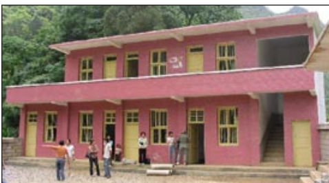
3E's new building for Guxin Primary School

We watched the children hard at work on their wobbly chairs and tables, learning